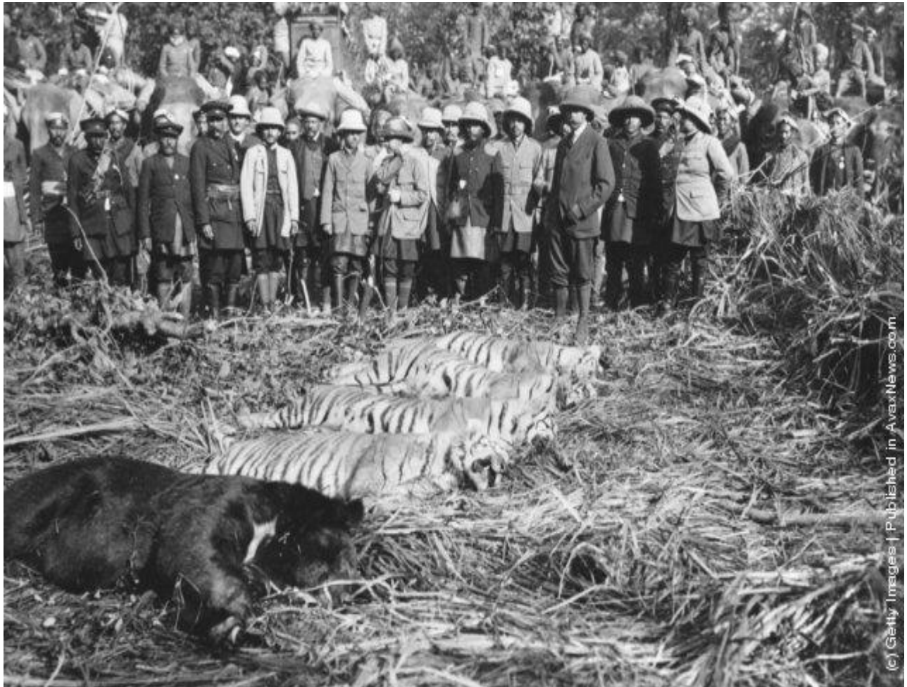
1.1 Tiger hunt in 1940s

$850, and otter skin was valued at $250” ( Tiger Bones and Rhino Horns , 3), according to a report in 2004.