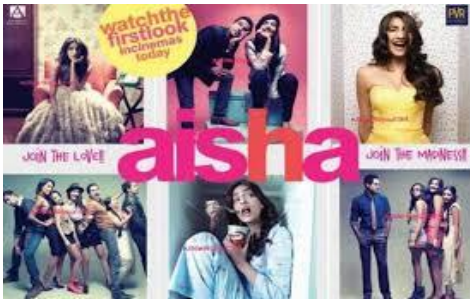
The poster of Aisha , the Bollywood version of Emma

When we begin with Aisha , her cultural adoption of Shefali , which is a postcolonial representation of Emma's taking on Harriet , underpins the colonial control and cultural hegemony of an upper-class woman over a lower class woman. According to a critic's review,