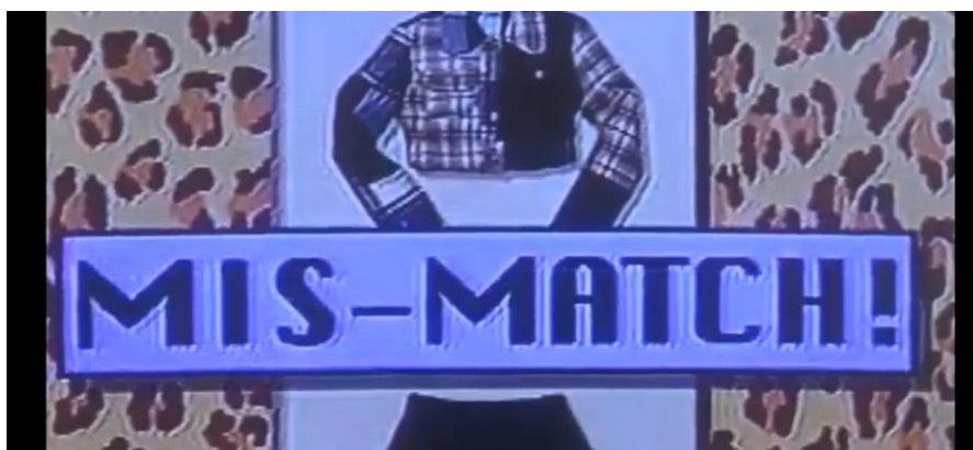
Figure 2: Cher chooses her regular school wardrobe in the computer for its proper outfit

At the very beginning of the movie Cher's predisposition for match/mismatch is being highlighted when she uses her computer to choose her school wardrobe and the computer screen shows the dress to be a mismatch.